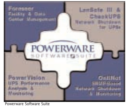
Powerware Software Suite

The Power Distribution Module has 10 receptacle panel slots, of which six can accommodate two-phase panels.